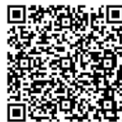
Scan to Give

We encourage you to worship God through faithful giving. To make an offering, scan the QR code, visit our website, or use the offering boxes located in the Worship Center and foyer.